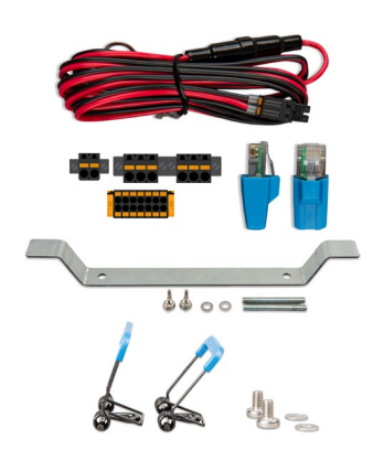
Accessories included with the Ekrano GX

The Ekrano GX installs easily via a cut-out for flush panel mounting and includes both a steel bracket and springs for blind hole mounting. All ports are easily accessible from the back. The power and relay terminal blocks can be screwed in place and the IO terminal block has a quick release clamp for easy access. The Bluetooth feature allows for quick connection and configuration via our VictronConnect app.