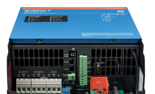
Connection Area MultiPlus-II 3k

voltage and with a smart phone or other Bluetooth enabled device.